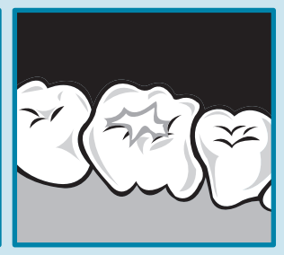
The sealant is in place.